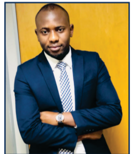
Unaswi Chalebgwa Cert (AML); AICA